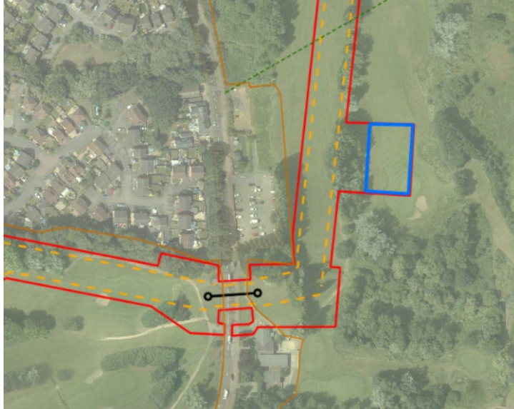
Illustration 3.1: Aerial view of construction compound 4AC