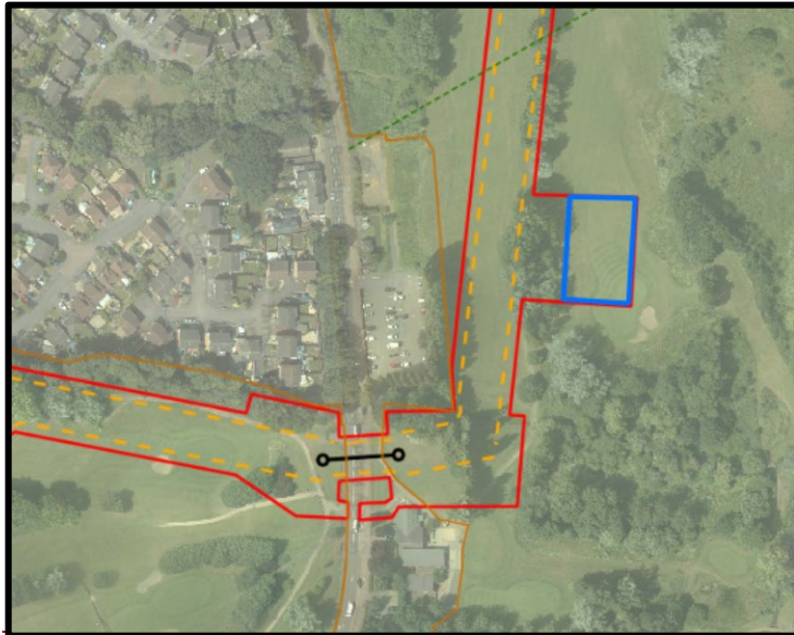
Illustration 3.3: Aerial view of compound 4AC

3.7.1 There will be a construction compound, 4AC, located to the west of the A327 Ively Road. The creation of the compound will take around three weeks